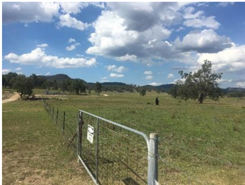
Fence and gate enclosing No Go Zone on right

Attachment 1: Photographs of No Go Zone and Fenced off Area (Aboriginal Heritage Protection area)