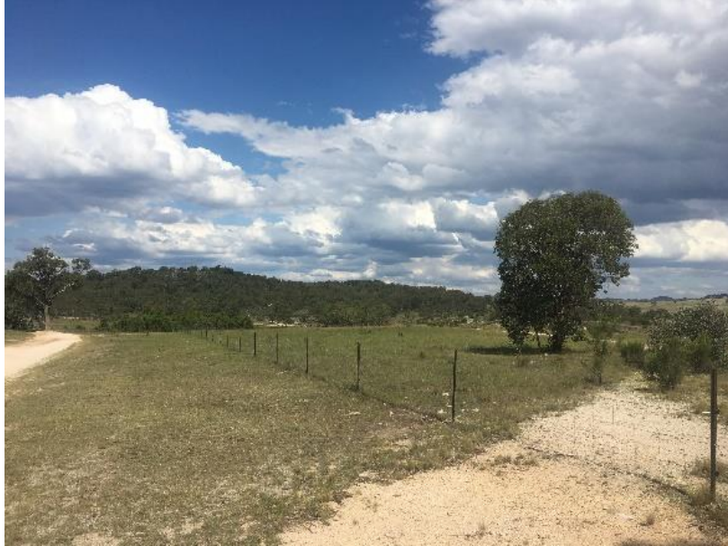
Fence enclosing No Go Zone at entrance to Bowdens Silver site office Driveway.