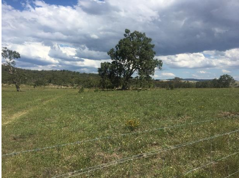
Fence enclosing No Go Zone and access track for water monitoring.