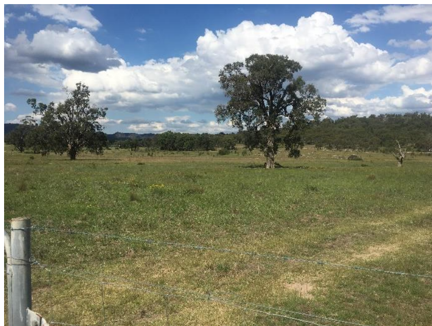
Fence enclosing No Go Zone and access track for water monitoring.