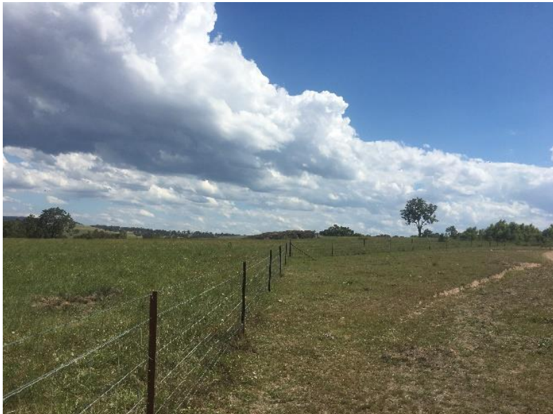
Fence enclosing No Go Zone on left and view of rock formation in centre of photograph.